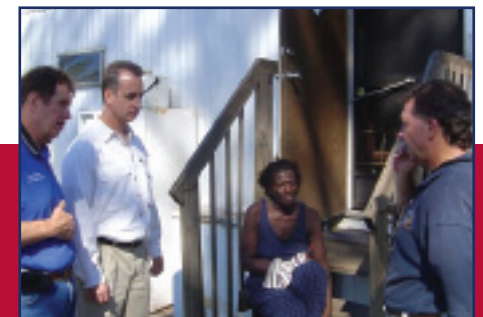
Congressman Mario Diaz-Balart assesses community needs with local leaders following Hurricane Wilma.